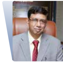
Shri. Amit Banerjee CMD, BEML